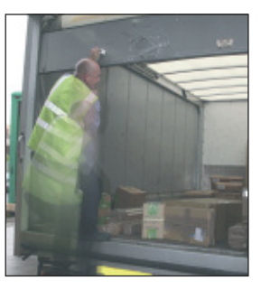
Instant response and no more "parachute jumping"